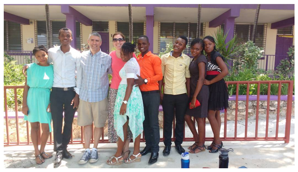
First Sunday Together