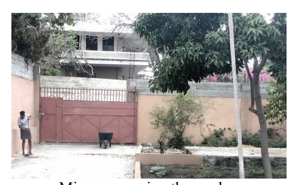
Mirese sweeping the yard

Dear Friends, spring has sprung here at EK! We don't have the four seasons but we do have wet and dry seasons. As we end a dry season and move into the wet, some trees are shedding their leaves instantly making new ones and some have begun to grow fruit once again. Our seriz tree is producing seriz (cherries), our citwon is growing new leaves and a few citwon (small limes), and our pomegranate is in bloom. We have also begun a few spring projects. We started some vegetable transplants, got a few plants for the front of the house and we will be planting two bougainvilleas near the front wall. It is nice to see some color and variety in the yard. We live in the city but there is a definite feeling of country inside our compound.